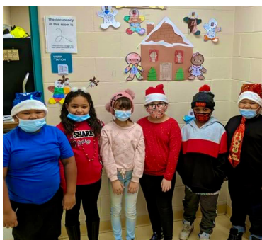
Above: Hat Day - Students from Room 212